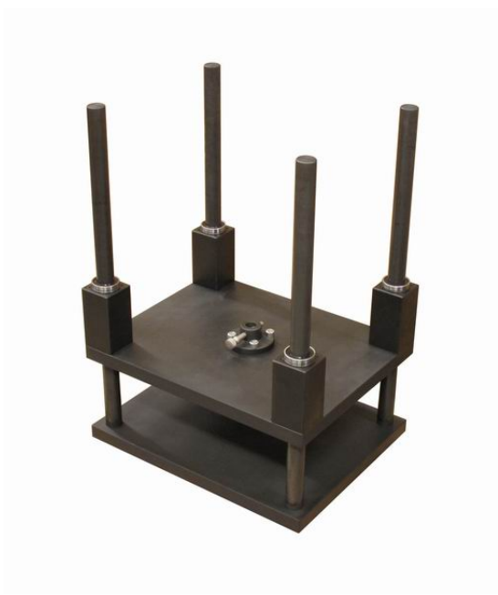
THS86-380x300-4G Af159 –St steel