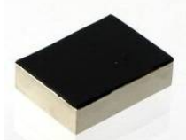
TH149-BG30x40 Height 30 mm x Width 40mm