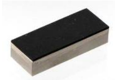
TH149-BG20x50 Height 20 mm x Width 50 mm