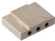
Height 30 mm x Width 200 mm – small pyramids 0.7x45