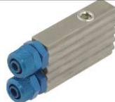
TH149-BWC Wave jaws with cooling hole