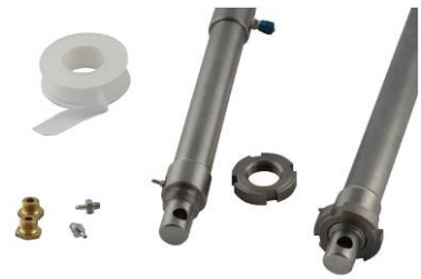
THS521-158-300 Pull rod 300 mm long