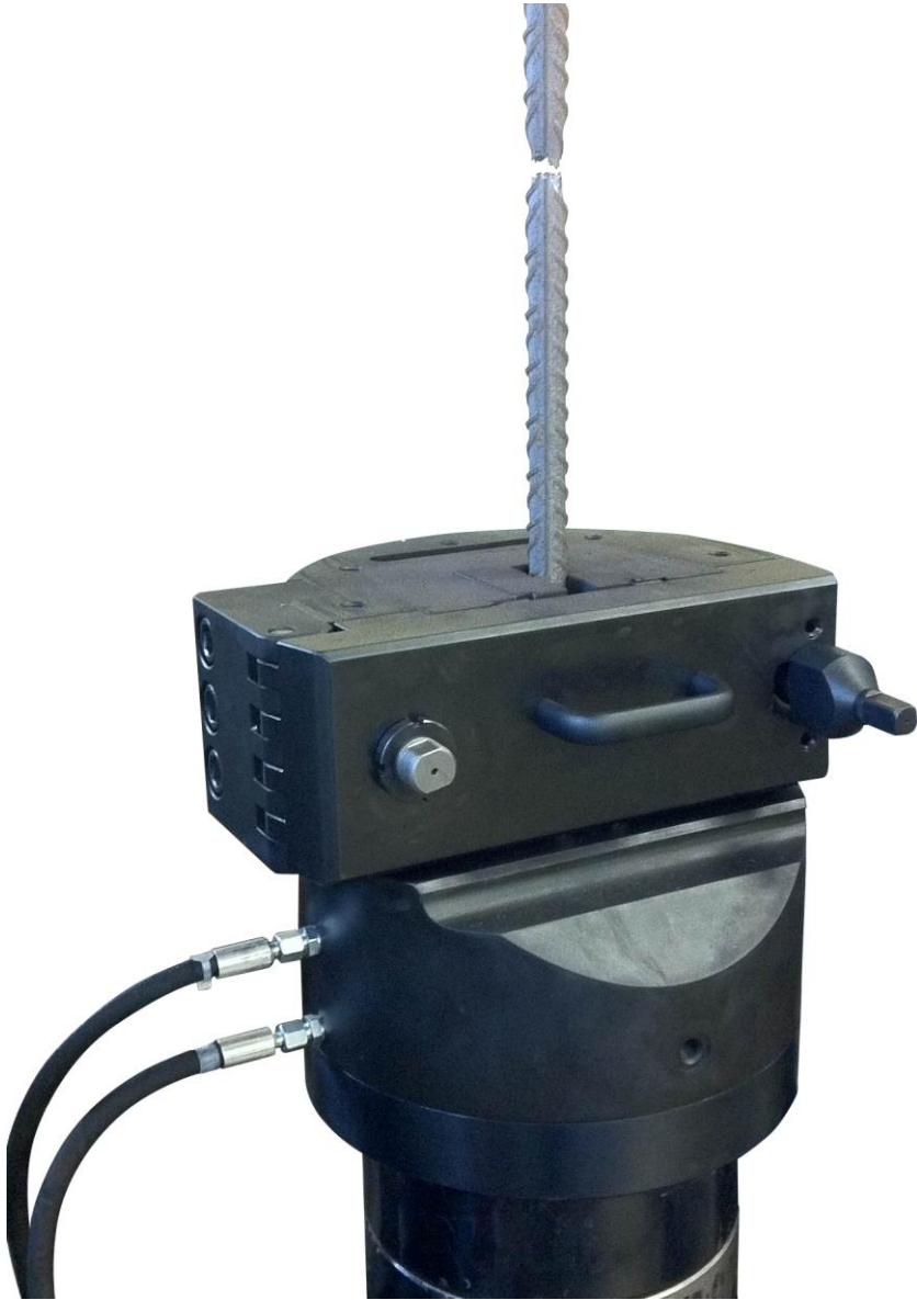
35mm diameter bar in machine