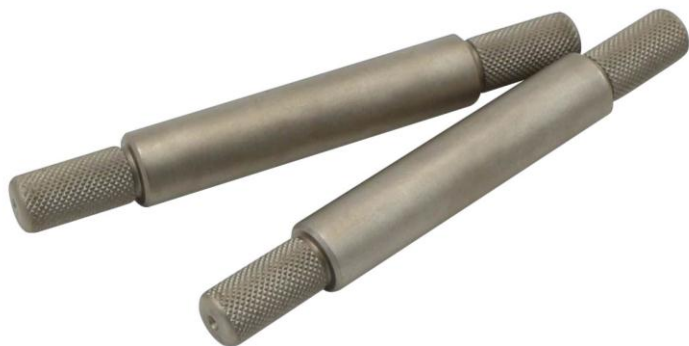
TH127-12.7x60-okp Locking pins without heads