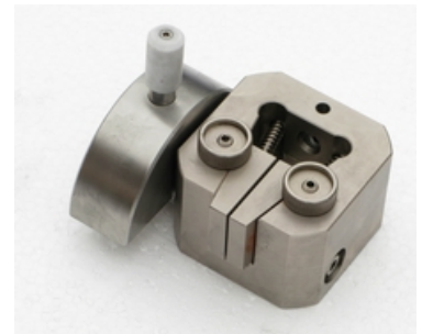
TH243-20+TK Option (for TH243-20 and TH243-50)