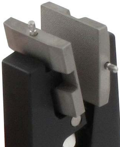
THS205k-BP20 Pyramid jaws 20x20mm