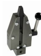
THS7 (wedge grip) Datasheet