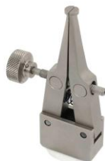
THS466-HD8-M4 keeping caps from inside 8mm diameter