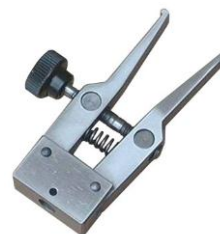
THS466-H2-M4 keeping caps from inside Hook2