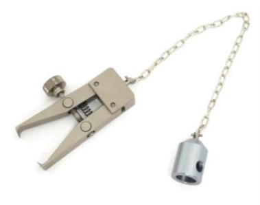
THS466-H1-K-Af159 chain adapter