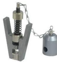
THS205k Data sheet