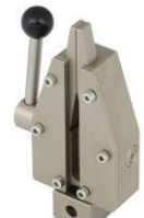
THS7 Data sheet