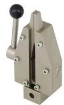
THS7 Data sheet