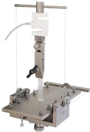
TH50 Peel test fixture Data sheet

THS470 can be used in combination with the following grips as upper grip: