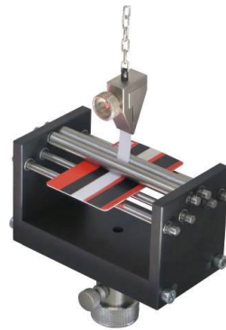
TH104 Peel test fixture Data sheet