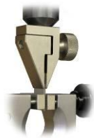
THS341 Data sheet