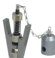
THS205k Data sheet