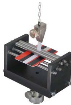
TH104 Peel test fixture Data sheet