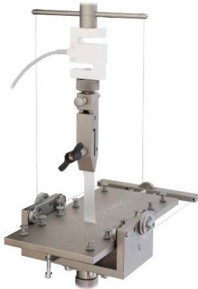
TH50 Peel test fixture Data sheet

THS341 can be used in combination with the following grips as upper grip: