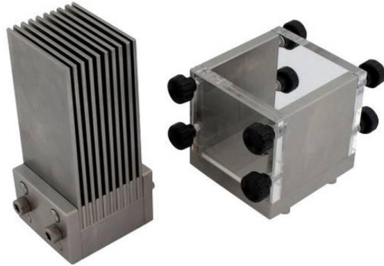
THS799-70-10B3X3 Plexiglas Version