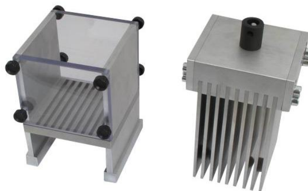
THS799-120-9B5X7 Plexiglas Version