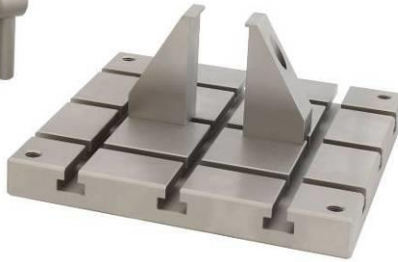
TH36T-250-ST+HL86x30 + TH154-S100-ST Special version to test car batteries