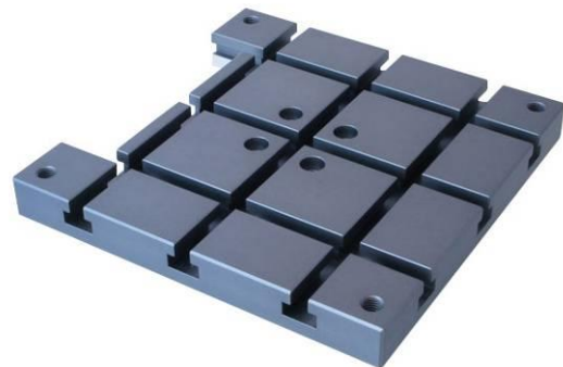
TH36T-250-ASP Platens with cut-outs for one-column tensile testers