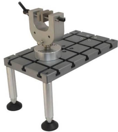
Usage on single-column tensile testers