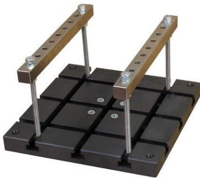
Usage with threaded bolts