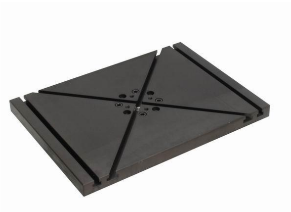
TH36T-550x400-SSW 1 Platens with diagonal slots