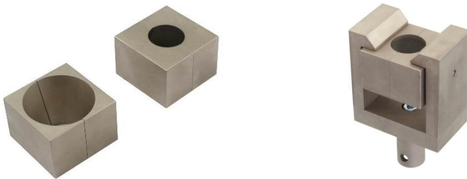
Inserts for holding the specimen